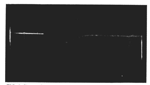
FIG. 1. Shape of laser radiation pulses (one horizontal division corresponds to 1 \mu sec).

A 30-40% change in the pulse duration, achieved by varying the pressure of the working mixture in the laser chamber, indicated that the optical breakdown of the molecular gases was governed by the power and not the energy of the radiation pulse. The brightness and the size of the spark produced on breakdown de-